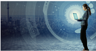
Autonomous Wave Control (AWC)