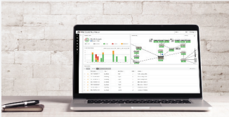
Vista Manager EX