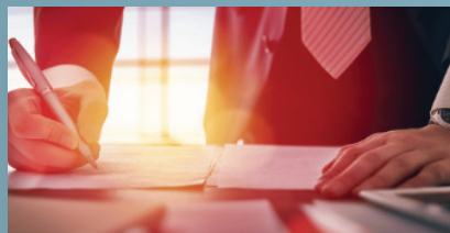
Autonomous Management Framework (AMF)